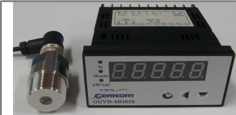
Fig. 1 UV Radiometer 5.0 (Size of Display : 97 × 50 × 112mm)