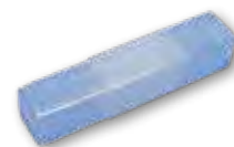
QUADROSAFE Art. No. 3070000149

Black plastic box with performed grooves to accept FIBERPOINT®, batteries dust cap and optional adapters (1.25 / SMA / POF)