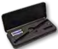
Etui Art. No. 3150000401

Black plastic material with preformed grooves to accept FIBERPOINT®, batteries, dust cap and one optional adapter (1.25 mm / SMA / POF)