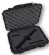
BOX Art. No. 3150001117

Black plastic material with preformed grooves to accept FIBERPOINT®, batteries, dust cap and one optional adapter (1.25 mm / SMA / POF)